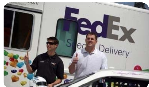
March of Dimes Dallas 2009