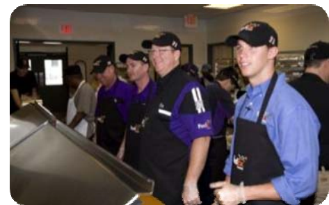
Deliver the Drive Boston 2008