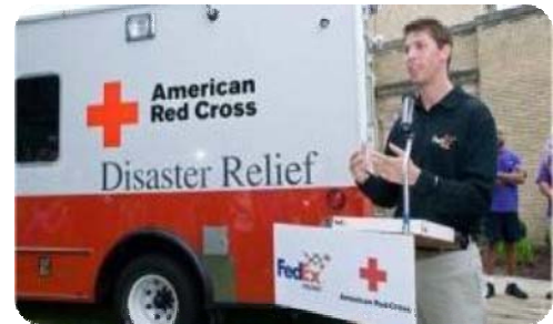
Racing to Prepare Richmond 2009