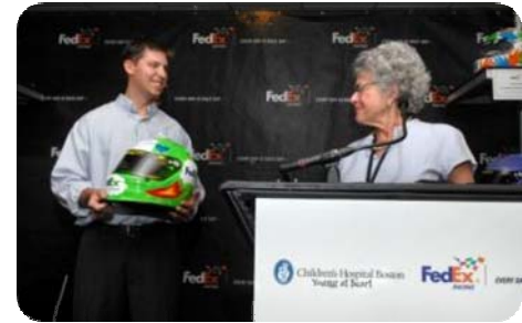
Wear Your Heart on Your Helmet Boston 2006

2006: Denny Hamlin and the FedEx Racing team made special deliveries to five children's hospitals, where Hamlin was presented with specially designed helmets for him to wear in Cup races in the hospital's home market. In addition to donations on behalf of FedEx for $25,000, the events featured activities for the patients and staff.