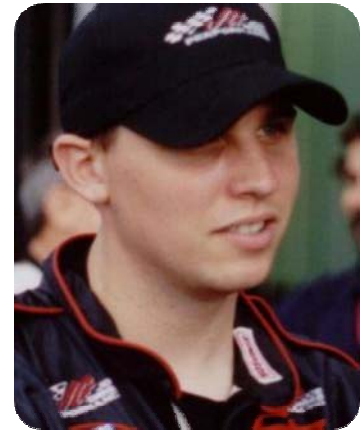
Denny Hamlin at his Craftsman Truck Series Debut – Indianapolis, Aug. 2004

Away from the track, Hamlin stays active – whether playing basketball or working out – and spending time with friends. He remains a committed fan of Virginia Tech and the Washington Redskins, and can be found courtside for Charlotte Bobcats home games.