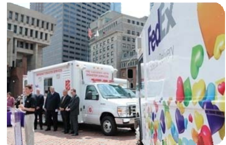
Salvation Army DRU Donation Boston 2010

2007: The FedEx commitment to children's health initiatives came to life in the form of the FedEx "Wear Your Heart on Your Helmet" program. Over the course of the season, FedEx worked with children's hospitals in seven NASCAR race markets, and also with the Make-A-Wish Foundation, to find patients interested in designing the race helmet Denny Hamlin would wear in 11 NASCAR Sprint Cup races.