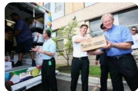
Racing to Prepare Washington, D.C. 2009